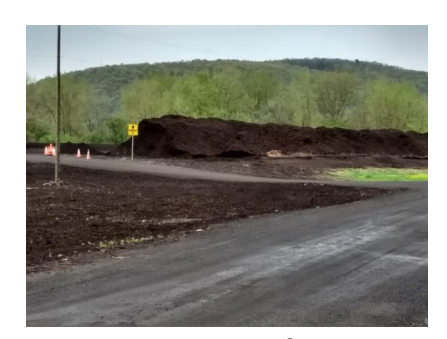
Free mulch pile at compost facility